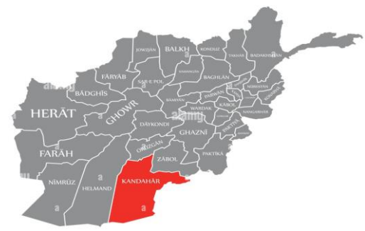
Figure 1: Location map of study area (Kandahar, Afghanistan).

Kandahar province is located in the southern part of Afghanistan and is one of the country largest provinces, covering an area of approximately 54,000 square kilometers. It is known for its historical significance and has been a center of trade and agriculture for centuries. The province is characterized by a semi-arid to arid climate, with hot summers and relatively mild winters. Kandahar is an important agricultural region, known for its production of fruits, particularly pomegranates and grapes, as well as wheat and other crops. The province also has significant mineral resources, including deposits of chromite, marble, and other minerals. Figure 1 shows the map of study area.